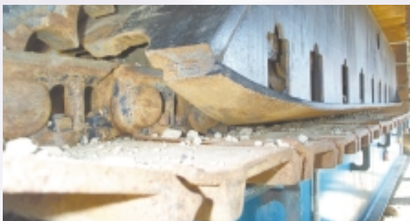
Soil contamination on machinery that was re-exported.

Australia has among the strongest quarantine measures anywhere in the world.