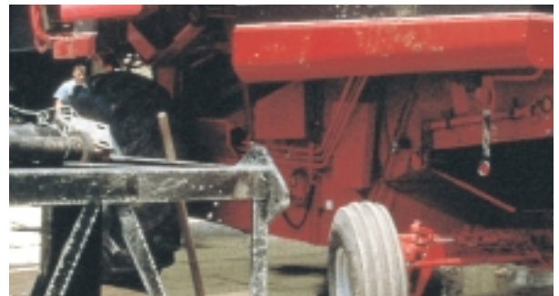
This header was re-exported even though it looked clean, because of unacceptable soil and plant contamination.

Many shipments of used machinery have already been refused importation and ordered for re-export. These consignments have included a bulldozer, wheel loader, wool carbonising machinery, chocolate processing equipment, excavator, drilling rig, soil compactor, soil stabiliser, backhoe and grader, forklift, hay baler and log loader.