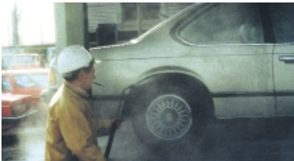
Importers are advised to thoroughly clean machinery off-shore.